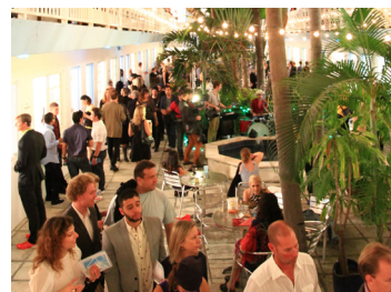
ART BASEL MIAMI