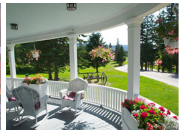
OMNI BRETTON ARMS INN