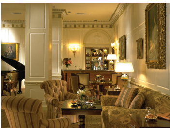
THE TAJ HOTEL, BOSTON

Through a special arrangement with the New England Museum Association, each issue is mailed directly to the association's nearly 500 institutional members—important decision makers and opinion leaders in New England's cultural scene.