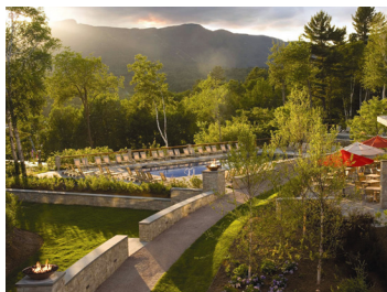
TOPNOTCH RESORT AND SPA