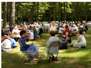
MACDOWELL COLONY MEDAL DAY