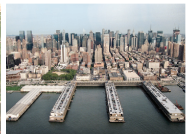
THE ARMORY SHOW