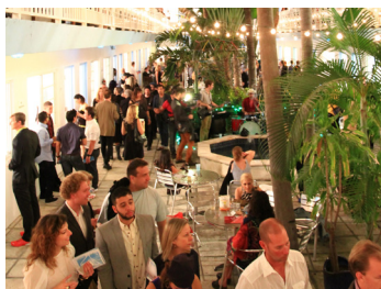
ART BASEL MIAMI